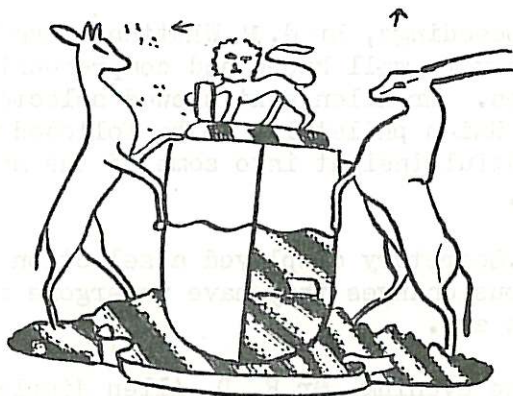
GROUP 3 - WITH A MINOR VARIETY